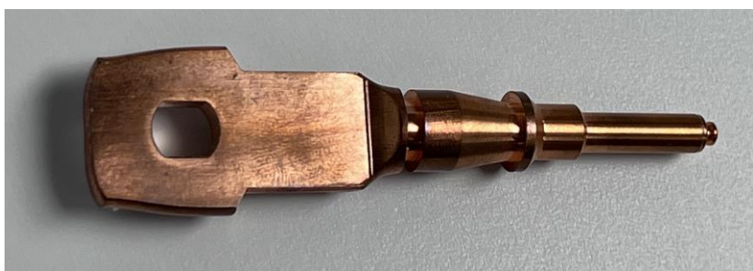
Flat Terminal / Bus Bar